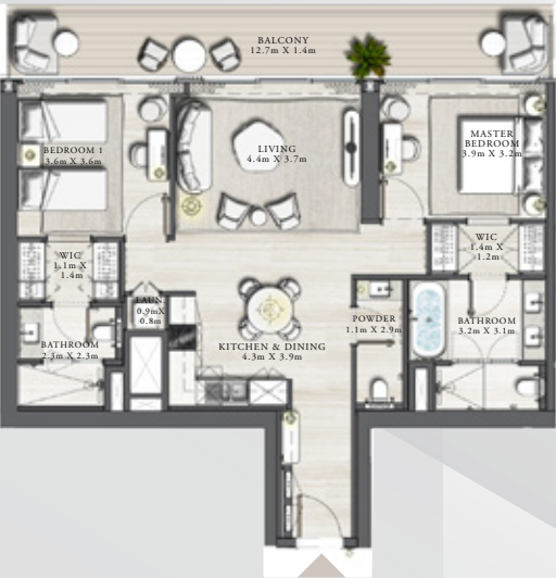
KEY PLAN LEVEL 36-54